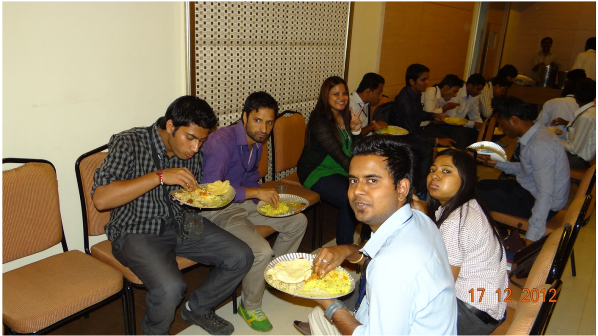
Students having Lunch at Pune