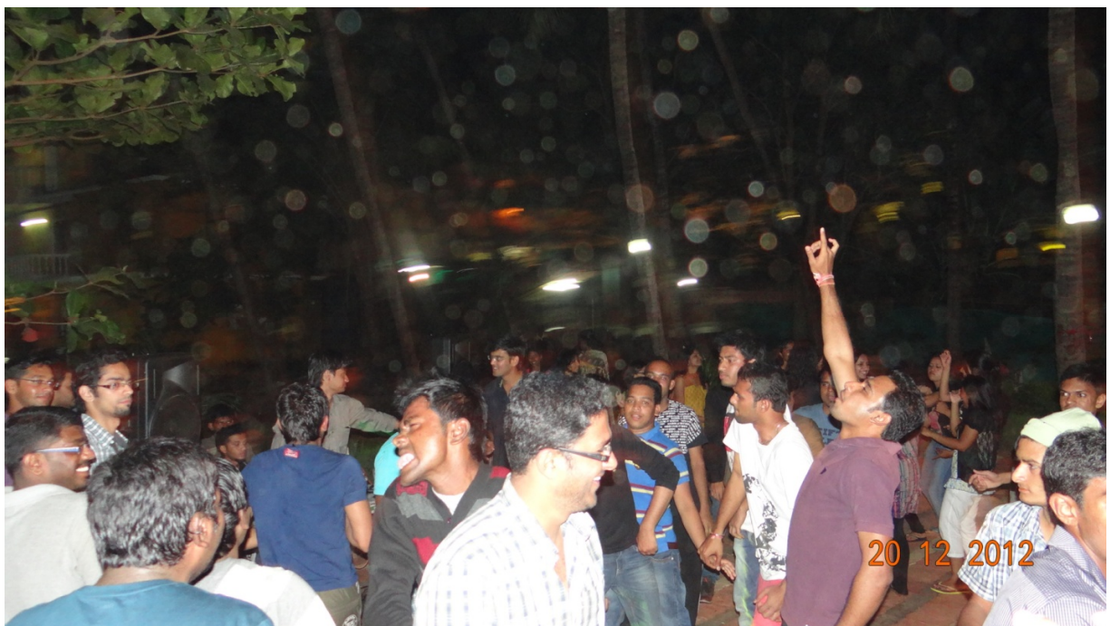
Students exhibiting their talents at a show organized at Goa