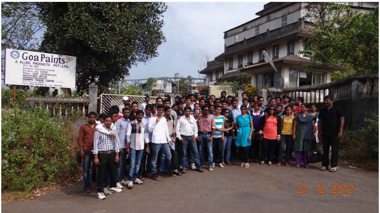
Industrial Visit by III semester MBA students to Goa Paints