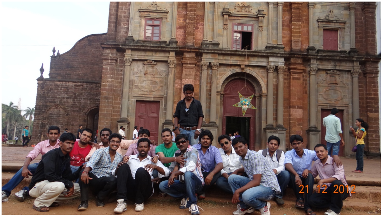
Students at Old Goa Church.