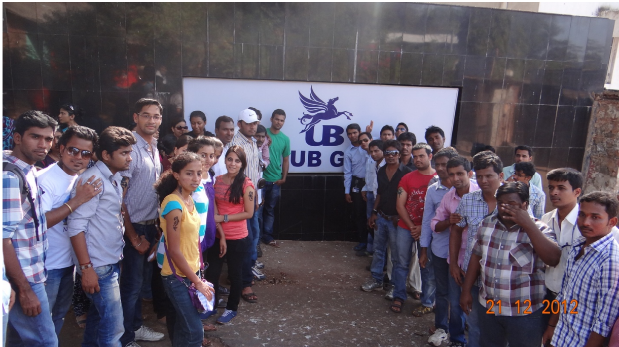
Industrial Visit by III semester MBA students to UB Groups.

United Breweries Group or UB Group is an Indian conglomerate company headquartered in UB City, Bangalore in the state of Karnataka. The company has annual sales of over US$4 billion and a market capitalization of approximately US$12 billion. Its core business includes beverages, aviation, electrical and chemicals. The company markets beer under the Kingfisher brand and has also launched Kingfisher Airlines, an airline service in India, whose operation has been stalled after licence is been revoked by DGCA. United Breweries is India's largest producer of beer with a market share of around 48% by volume.