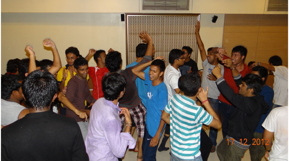
Students at a cultural show at Pune.