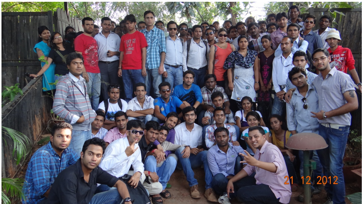
Group Photo of III Semester MBA students at Goa.